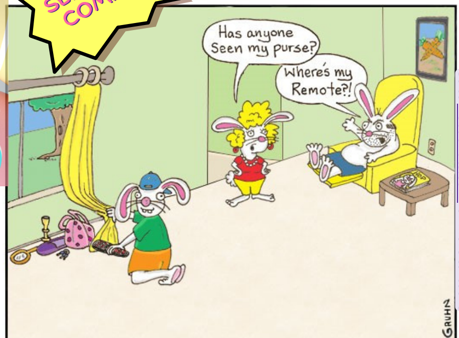
The Easter Bunny as a teenager